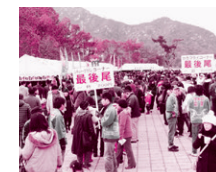
Miyajima Oyster Festival

January Momotesai February Miyajima Oyster Festival April Toukasai Walking Over Fire Ceremony Toukasai Ceremony, Noh